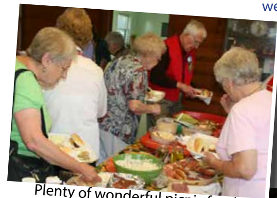
Plenty of wonderful picnic food

were guests at our August Pot Luck Picnic