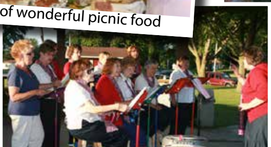
The Highland Voices Entertained Us