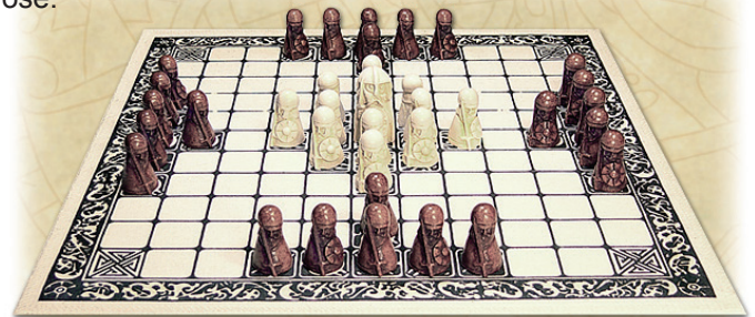
THE VIKING GAME "HNEFATAFL" PRONOUNCED NEF-AH-TAH-FEL, WAS THE MOST POPULAR BOARD GAME OF ITS TIME.

While Vikings lived hard lives with little time for leisure activities, they were certainly adept at amusing themselves when the opportunity arose.