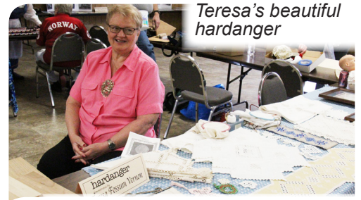
Teresa's beautiful hardanger