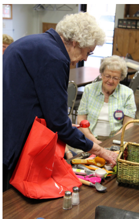
Georgia shares her newest collection: ice cream scoops!