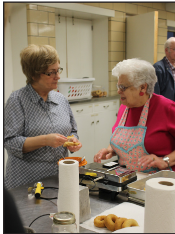
Geneva discussing strull verses krumkake....