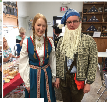
<<<< We had a Nisse (and his friend) bring us good fortune all day! <<<<