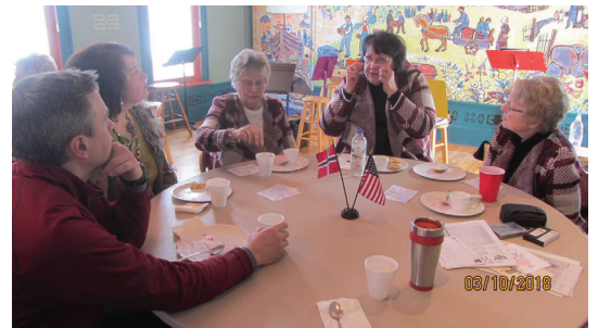
The Highland Voices entertained us at our March, Saturday morning meeting. Afterwards we enjoyed a delicious lunch and lots of visiting