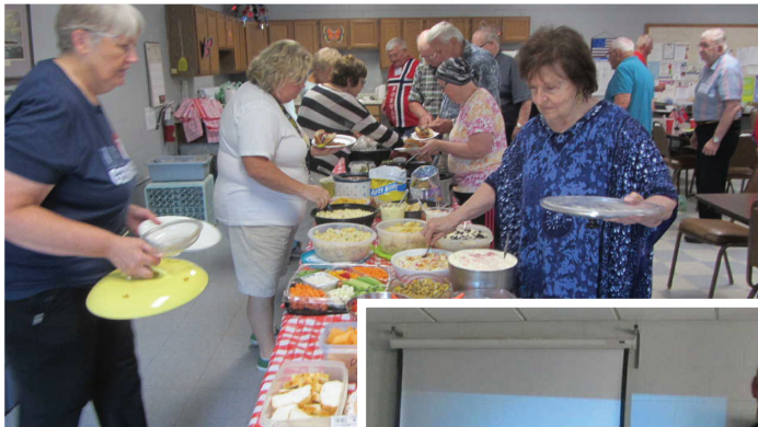
Food, food and more food!