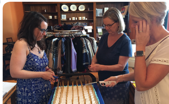
Lighting a hundred candles -- not something you get to everyday.