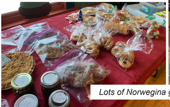
Lots of Norwegian goodies!