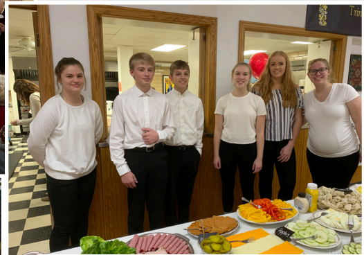
Trinity Youth helped with serving and clean up.