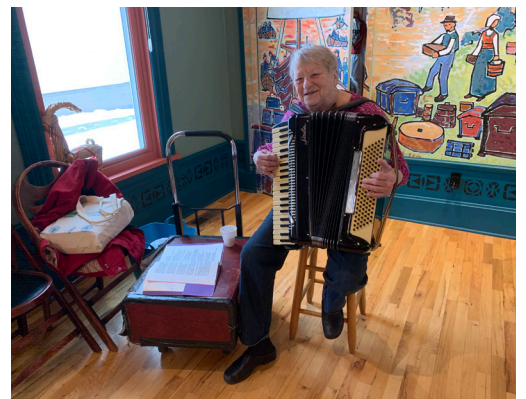
The Amazing Audrey!!