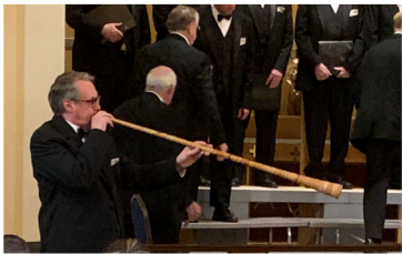
The Lur called in the Luren singers