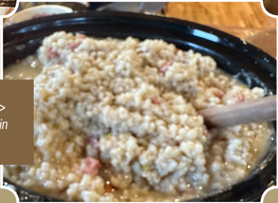
Viking Food! The Traveler's Porridge >> was good! Barley cooked in ham/bacon broth.