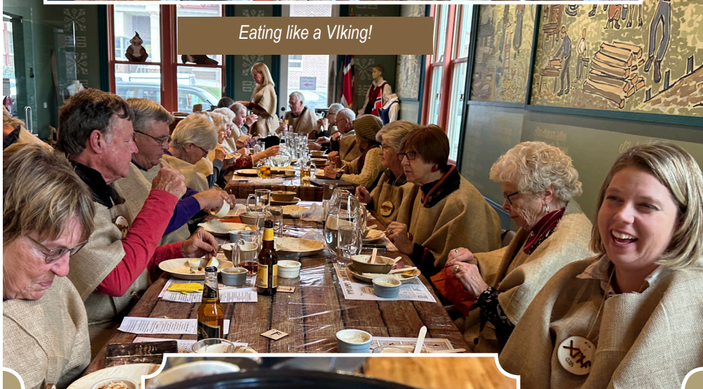
Eating like a Viking!