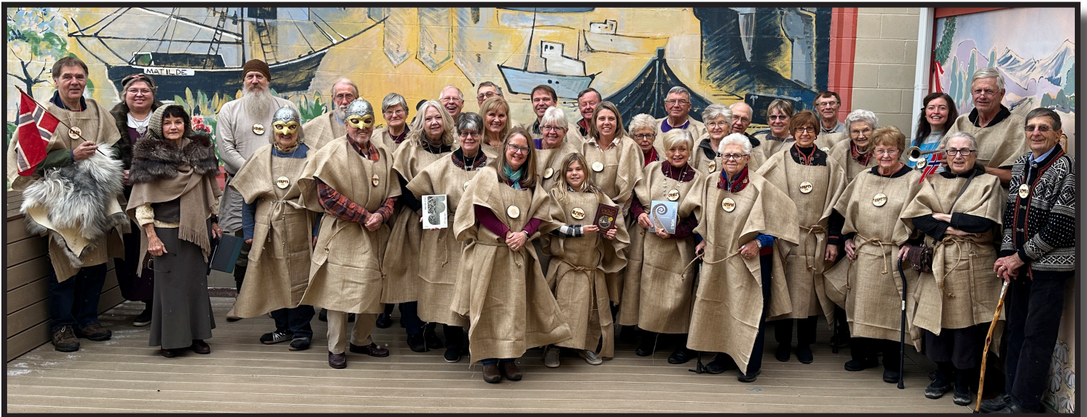
Our Vikings look pretty happy! Maybe because they all had NEW burlap outfits!?!