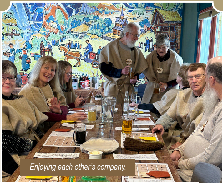
Enjoying each other's company.