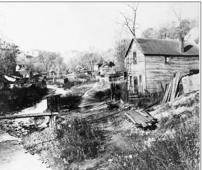
Above photo: Swede Hallow circa 1930