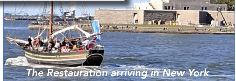
The Restauration arriving in New York

Join us for our DECEMBER MONTHLY MEETING! It will be Our Annual Sons of Norway