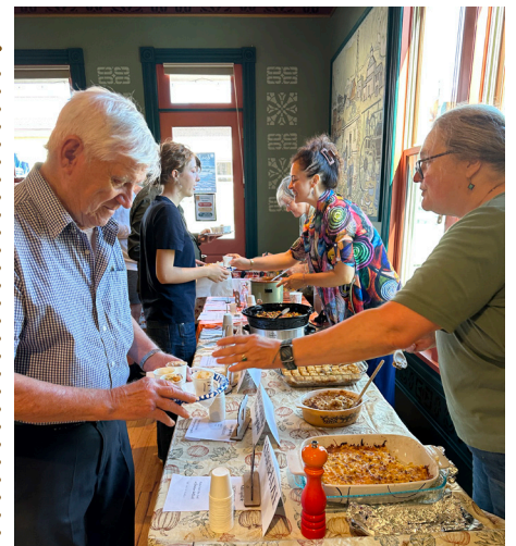
Getting samples of all the hotdishes to try and vote on!

We had goodies, sandwiches, rommegrot and some great coffee.